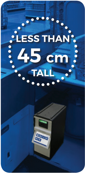
Installed directly at the point of sale

The SDS-35 is one of the smallest solutions on the market, allowing it to be installed directly at the point of sale for instant access. Less than 45 cm tall and weighing only 22,1 kg, the SDS-35 can be mounted directly under your counter top or directly to the floor.